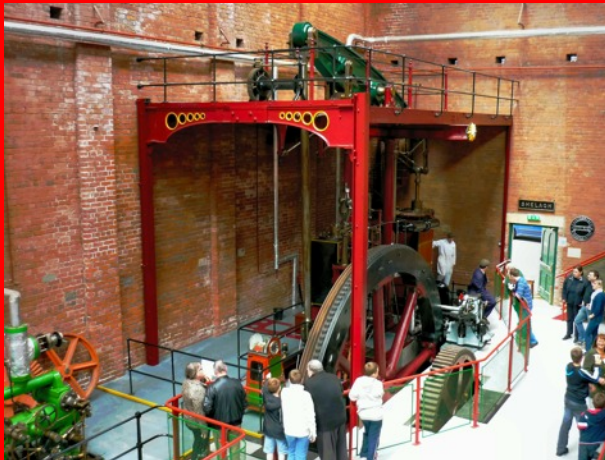
McNaught compound beam engine from a mill in Marsden, near Huddersfield

Our larger engines include a giant 40-ton "McNaughted" beam engine, a very rare 1840 twin-beam engine and a unique "non-dead-centre" vertical engine built by Musgraves of Bolton. A number of other engines are also on display, including a small engine "Caroline" that used to drive Fred Dibnah's workshop. All of them can be seen in motion on regular steam days.