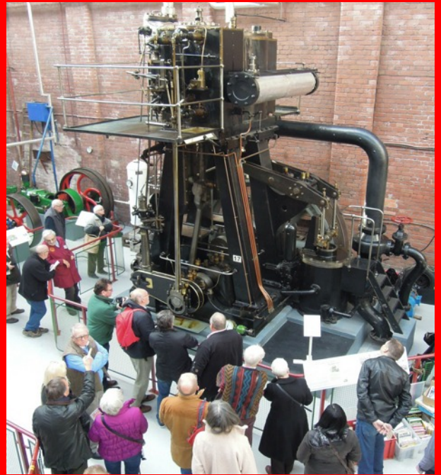
An inverted vertical engine from the "Diamond Ropeworks" at Royton, nr Oldham

There is free parking on the Supermarket car-park and a small shop and refreshment stall operate on steam days. Admission is free but donations are appreciated to help meet the cost of raising steam in the boiler. The museum is disabled-accessible with level floors, lift and toilets.