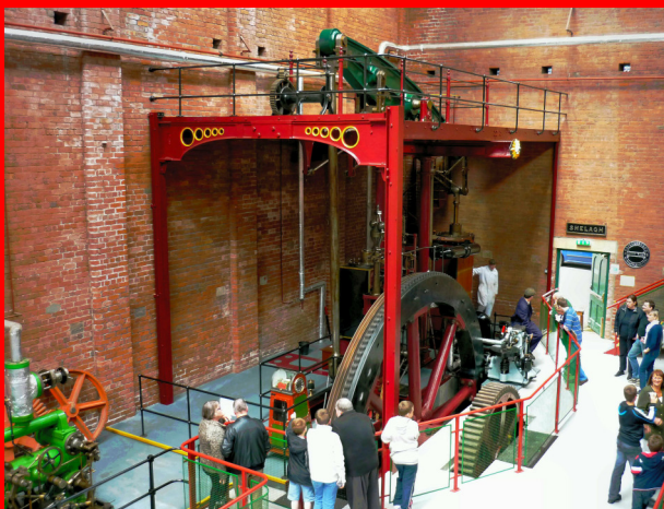
McNaughted compound beam engine from a mill in Marsden, near Huddersfield

Our larger engines include a giant 40-ton "McNaughted" beam engine, a very rare 1840 twin-beam engine and a unique "non-dead-centre" vertical engine built by Musgraves of Bolton. A number of other engines are also on display, including a small engine "Caroline" that used to drive Fred Dibnah's workshop. All of them can be seen in motion on regular steam days.