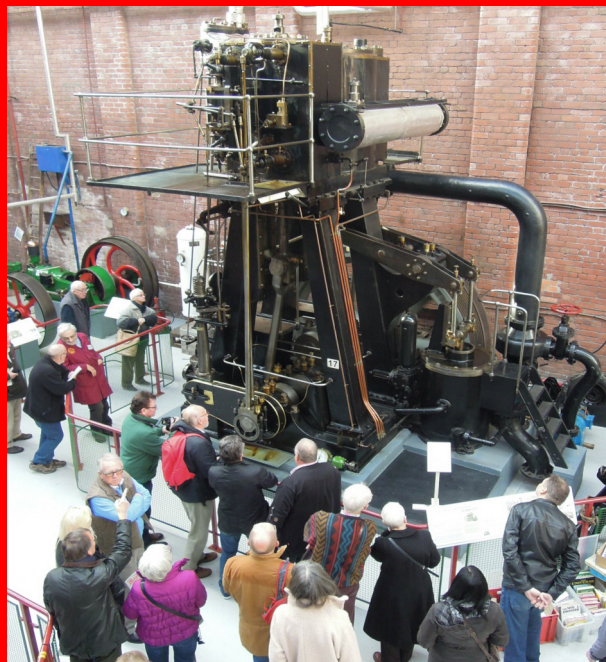
An inverted vertical engine from the "Diamond Ropeworks" at Royton, nr Oldham

There is free parking on the Supermarket car-park and a small second-hand book shop and refreshment stall operate on steam days. Admission is free but donations are appreciated to help meet the cost of raising steam in the boiler. The museum is disabled-accessible with level floors, lift and toilets.