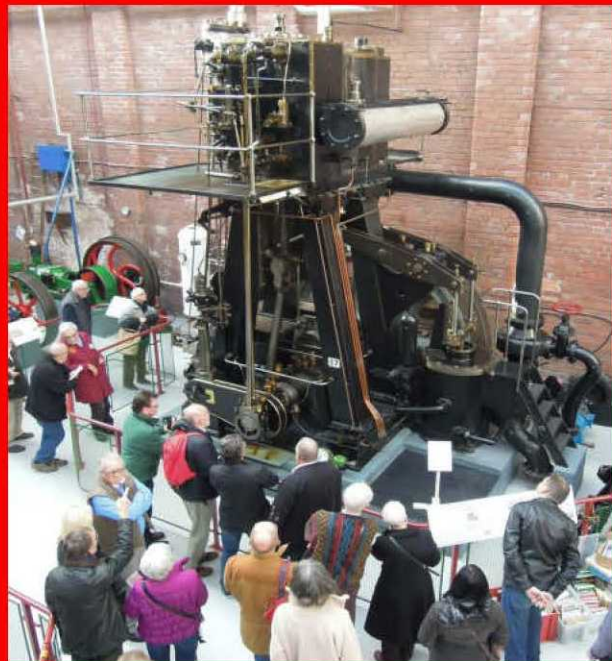
An inverted vertical engine from the "Diamond Ropeworks" at Royton, nr Oldham

There is free parking on the Supermarket car-park and a small second-hand book shop and refreshment stall operate on steam days. Admission is free but donations are appreciated to help meet the cost of raising steam in the boiler. The museum is disabled-accessible with level floors, lift and toilets.