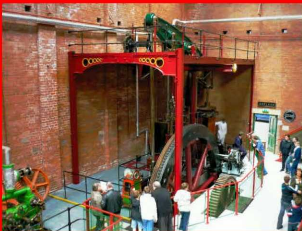
McNaughted compound beam engine from a mill in Marsden, near Huddersfield

Our larger engines include a giant 40-ton "McNaughted" beam engine, a very rare 1840 twin-beam engine and a unique "non-dead-centre" vertical engine built by Musgraves of Bolton. A number of other engines are also on display, including a small engine "Caroline" that used to drive Fred Dibnah's workshop. All of them can be seen in motion on regular steam days.